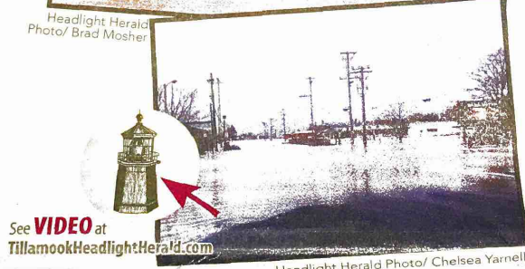
See VIDEO at TillamookHeadlightHerald.com