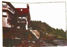
Morgan Kottre's neighborhood experienced devastation during the Dec. 8-9 storm in Tillamook. A GoFundMe page has been created for their benefit.