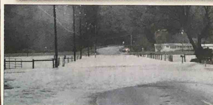
Left: Water floods Alderbrook Road on Sunday.